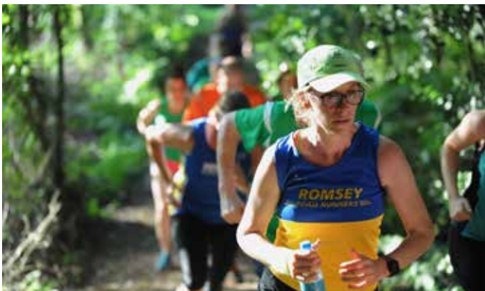
Manor Farm RR10