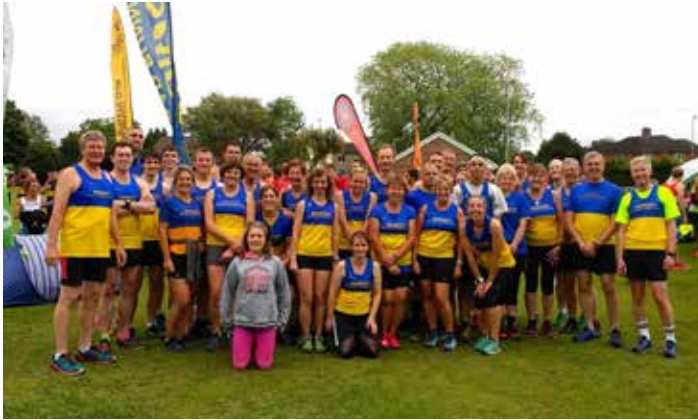
Romsey Road Runners at the Eastleigh RR10 race