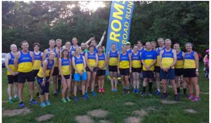
Romsey Road Runners at the Manor Farm RR10 race